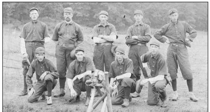
An Antigo team travelling to a road game in Mattoon